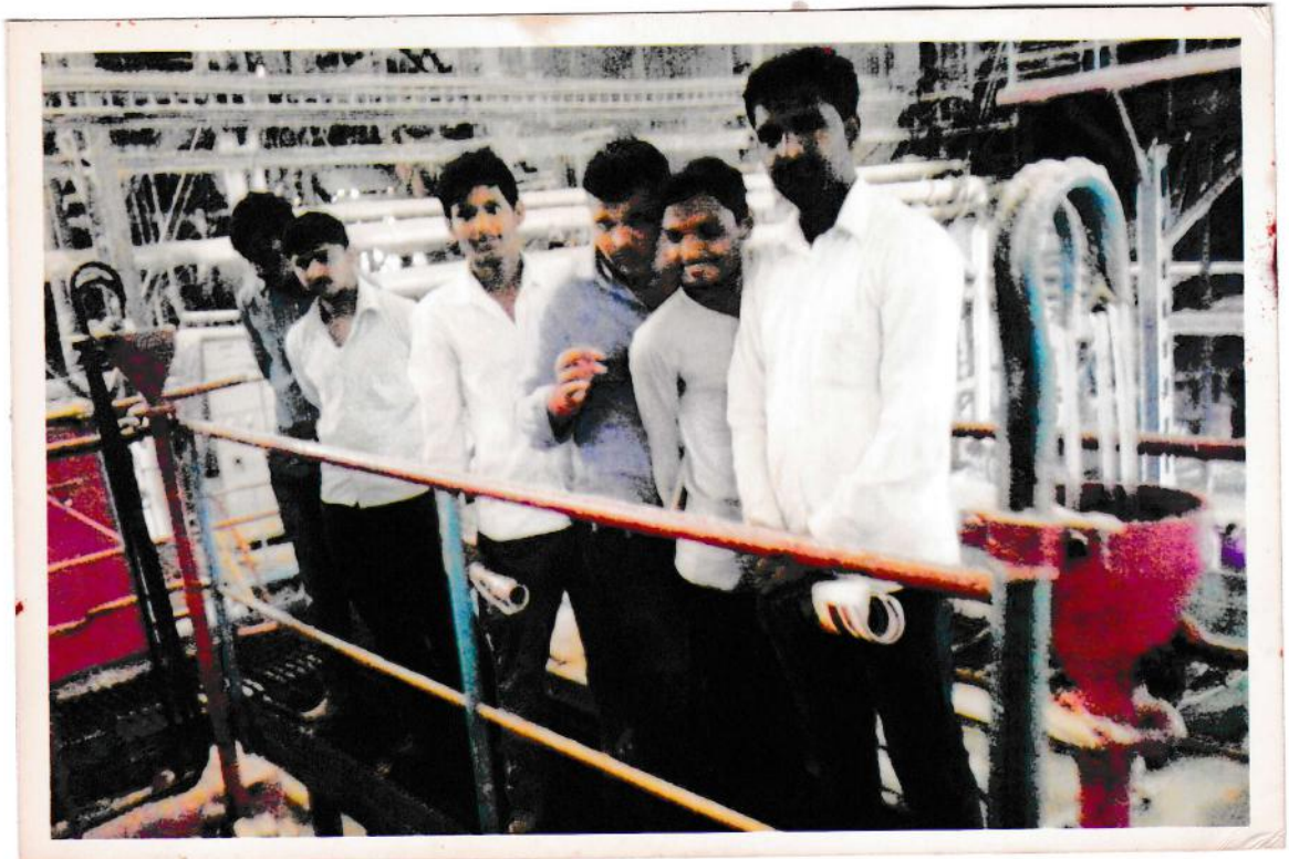
M.Sc. I Field Visit at Rajarambapu SSK. Ltd. Rajaramnagar Salcharale Unit No. 01.