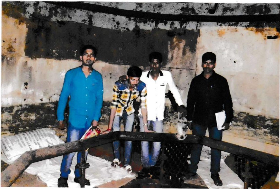
B.Sc. II Field Visit Vishwasrao Maik SSK Ltd. Chikha,